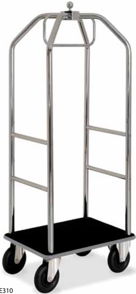
Item 1922CN + SE310