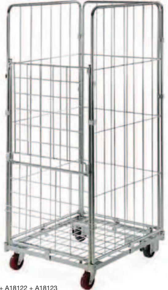
Art. 1812 + A18122 + A18123