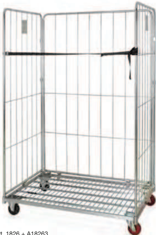
Art. 1826 + A18263