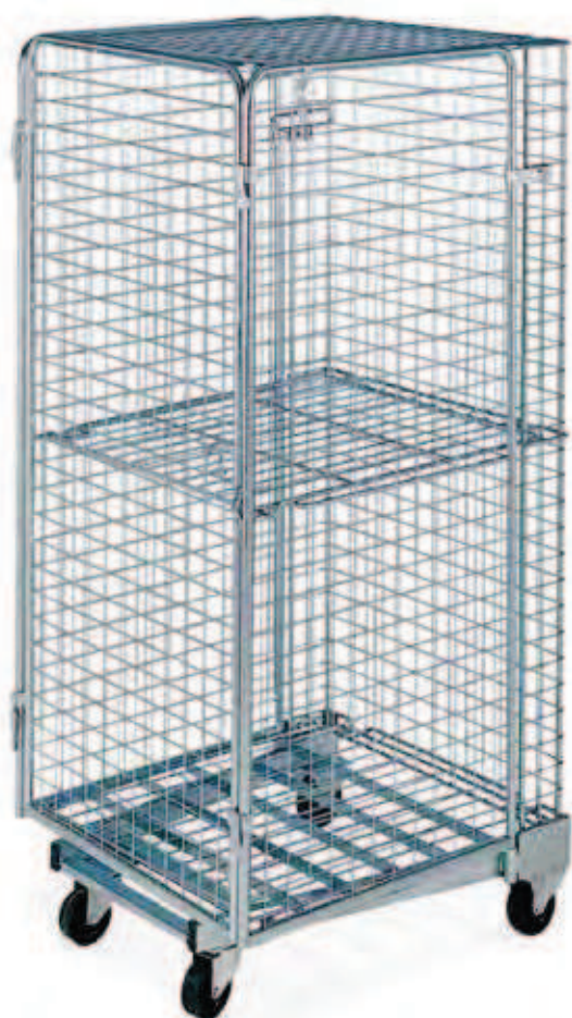
Art. 1814 + A18141