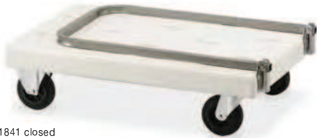
Art. 1841 closed