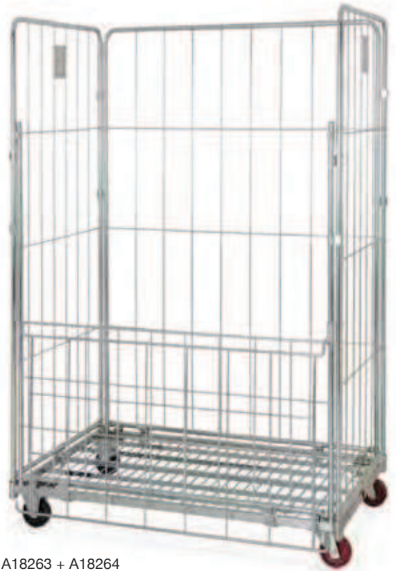
Art. 1826 + A18263 + A18264